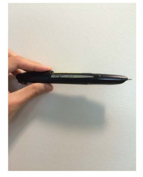
The digital pen