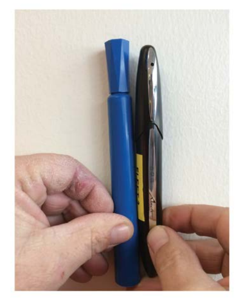
The digital pen in comparison with a highlighter