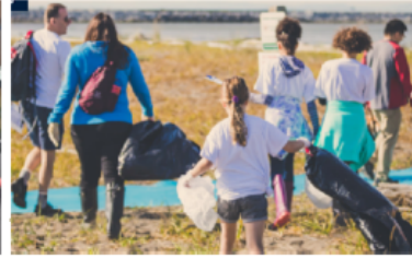
Shoreline & Community Cleanups