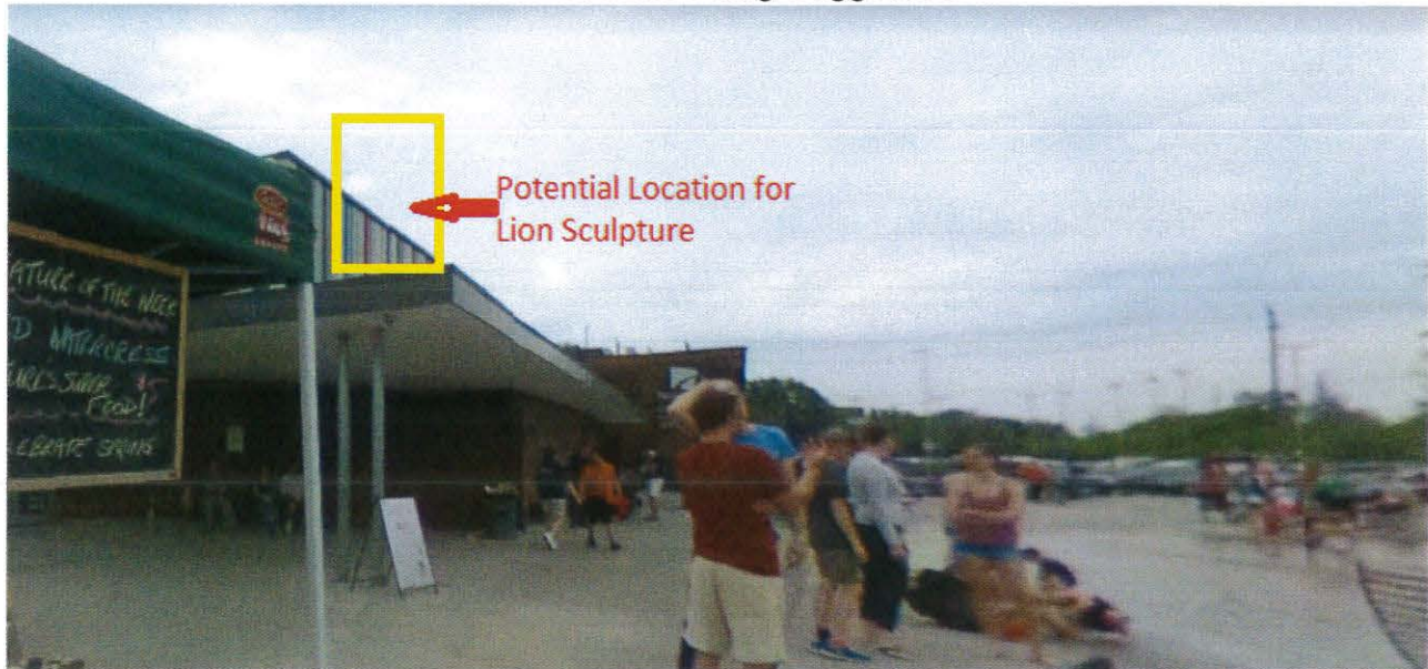
FIGURE 2 New Location Being Suggested