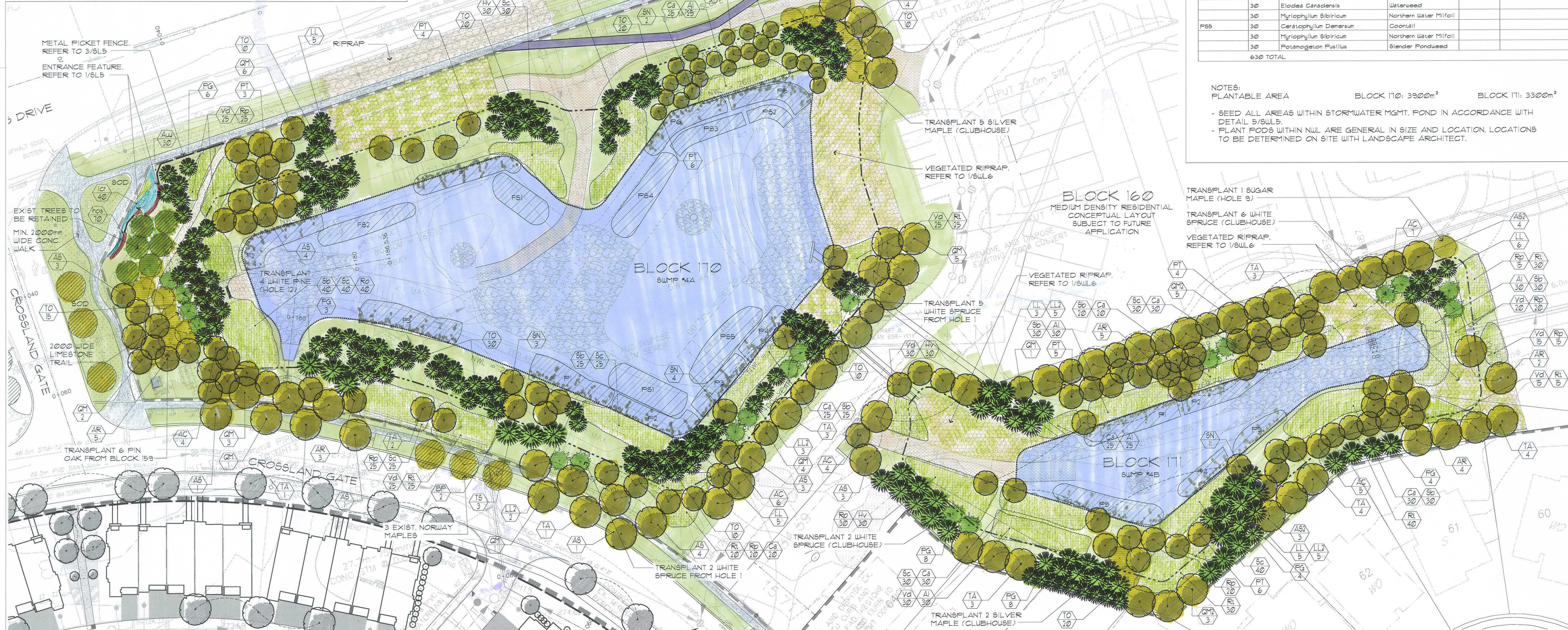
1 LANDSCAPE PLAN SWL1 SCALE: 1:400